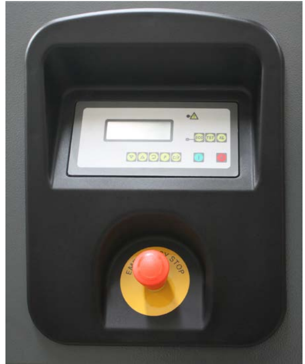
Example: from KTD-BN 1380 ESD3 control is an option