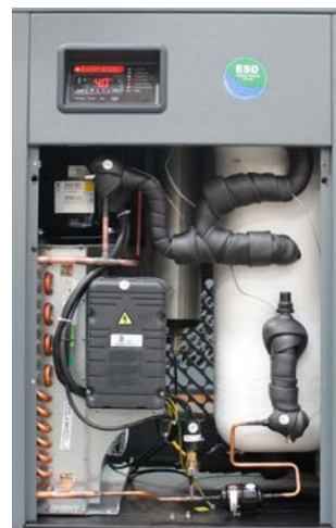
easy access to clear structured interior